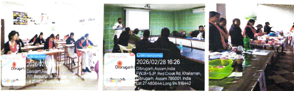
Doodling Competition, Quiz Competition, and Exhibition-cum-Sale (from left to right)