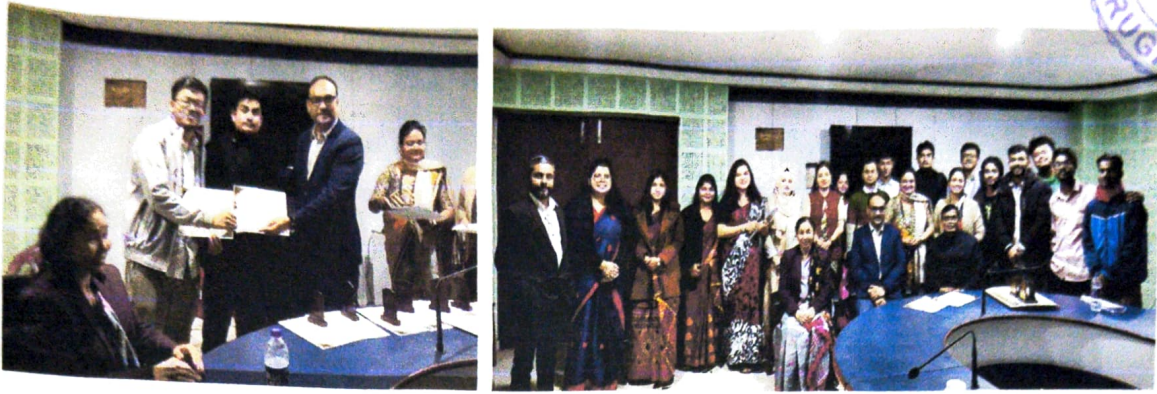
Winners of the Quiz Competition, and Group Photo with the Participants (from left to right)