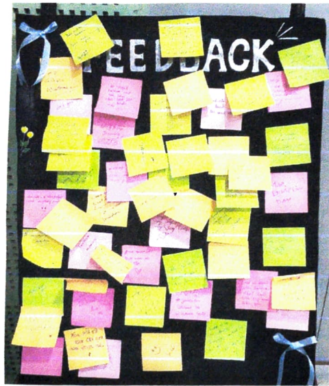
Words of Encouragement and Feedback from the Participants of the Various Institutes