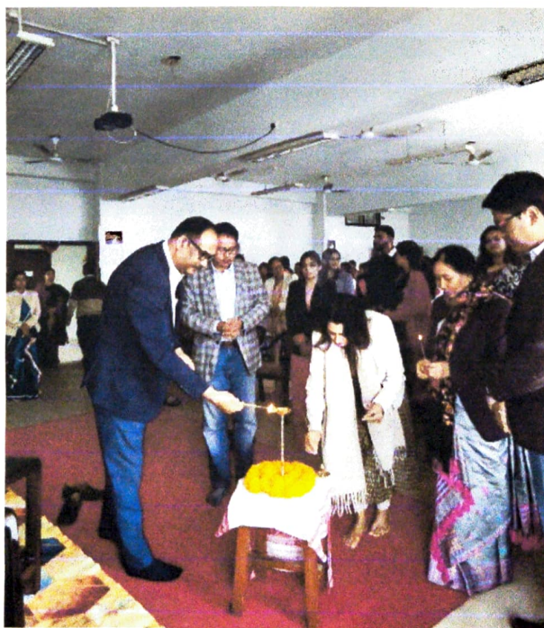
Lighting of the Lamp by the Dignitaries