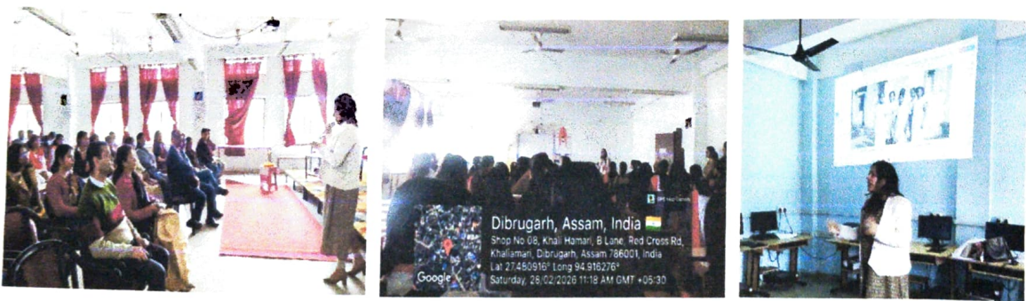
Delivery of the Talk by the Guest of Honour